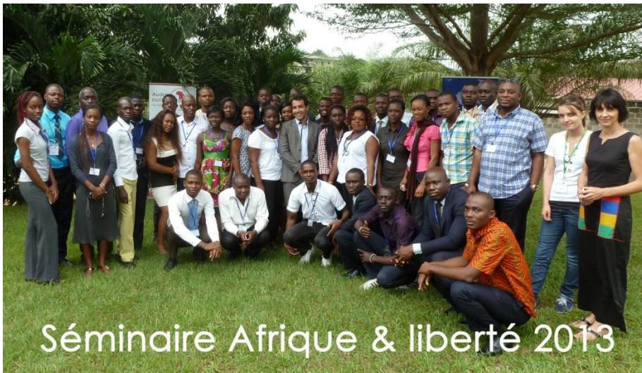
Séminaire Afrique & liberté 2013